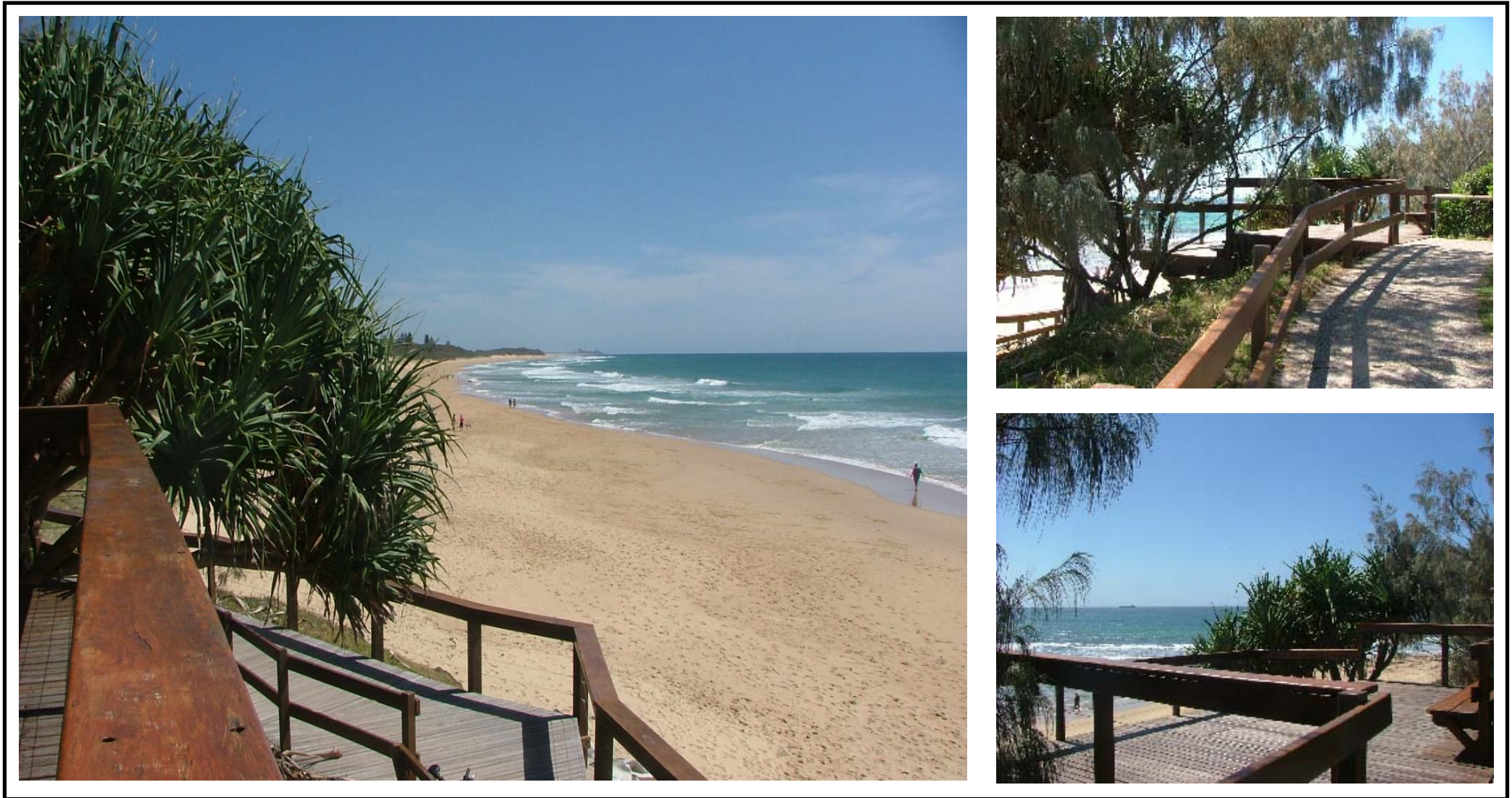
CURRIMUNDI - BUDERIM STREET, BALLINGER BEACH